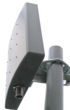
Front View of antenna