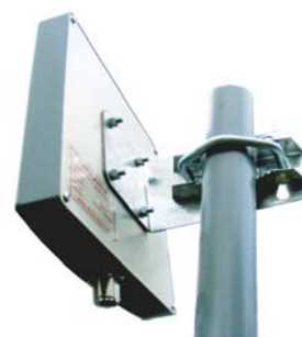
Pole mount tilting barcket fitted to antenna