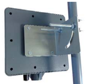
Back view showing tilting bracket on a pole

Application: Building to Building Connectivity, Bridging, Backhauling , Outdoor Access Point for 802.11 b/g.