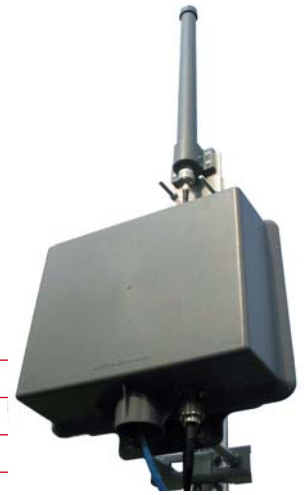
RFT-Link connected to an external omnidirectional antenna. (Access Point)