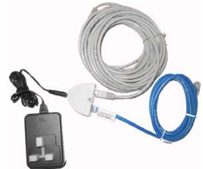
Power Over Ethernet Injector connections.

Blue: CAT5 cable (Data) connects to PC or Hub