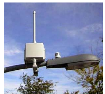
Urban deployment example.