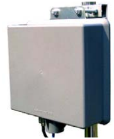
Front view of RFT-Link mounted on a pole

T: +44 (0)114 270 08 87 F: +44 (0)797 725 42 81 E: sales@rftechnics.com RFTECHNICS.COM